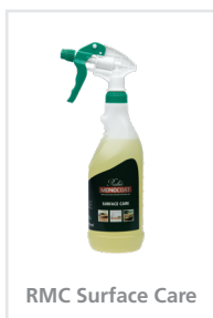
RMC Surface Care

Check the packaging and the safety data sheet for more details.